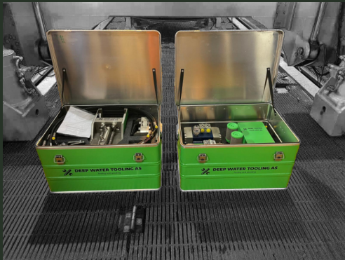
The Water Tooling Pack accompanying the BAG10 Grab

The set includes the DWT Water Valve Pack™, water pump and hoses as well.