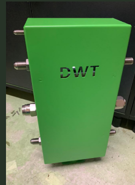
DWT Water Valve Pack™ containing dual water high flow valves.